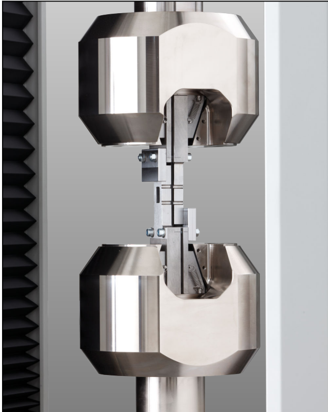
Open-hole compression fixture, force application via specimen grips