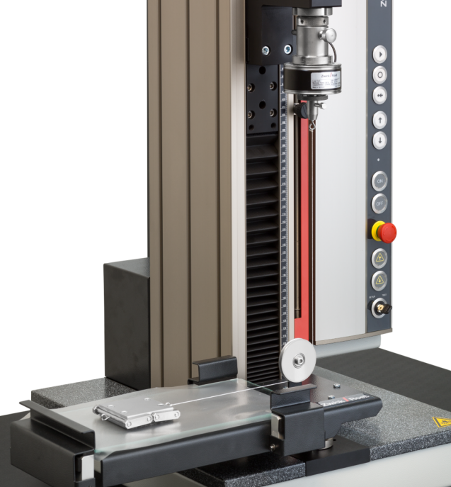
Device for testing the frictional properties of plastic films