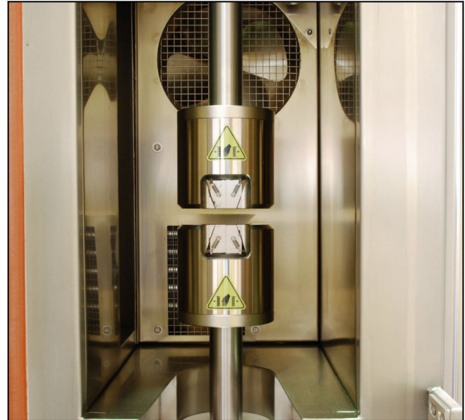
BOW-25 hydraulic wedge grips - temperature-chamber version

The grips are designed for 210 bar and can be connected to 210-bar and 280-bar systems via the grip control unit.