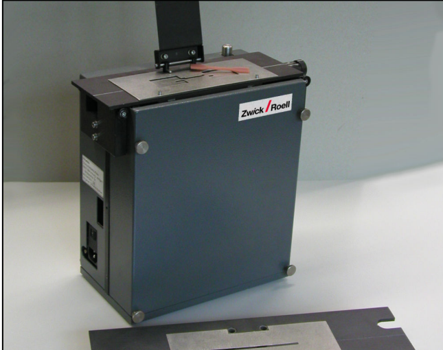
Automatic marking device, additional stencil for marking gauge lengths 50 to 100 mm